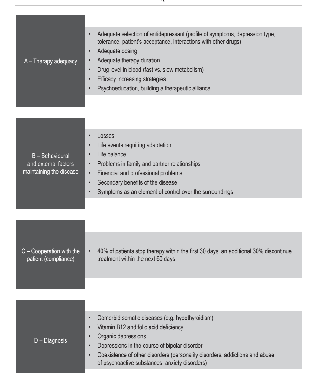
Figure 2. Diagnostic and clinical guidelines in the treatment of depression